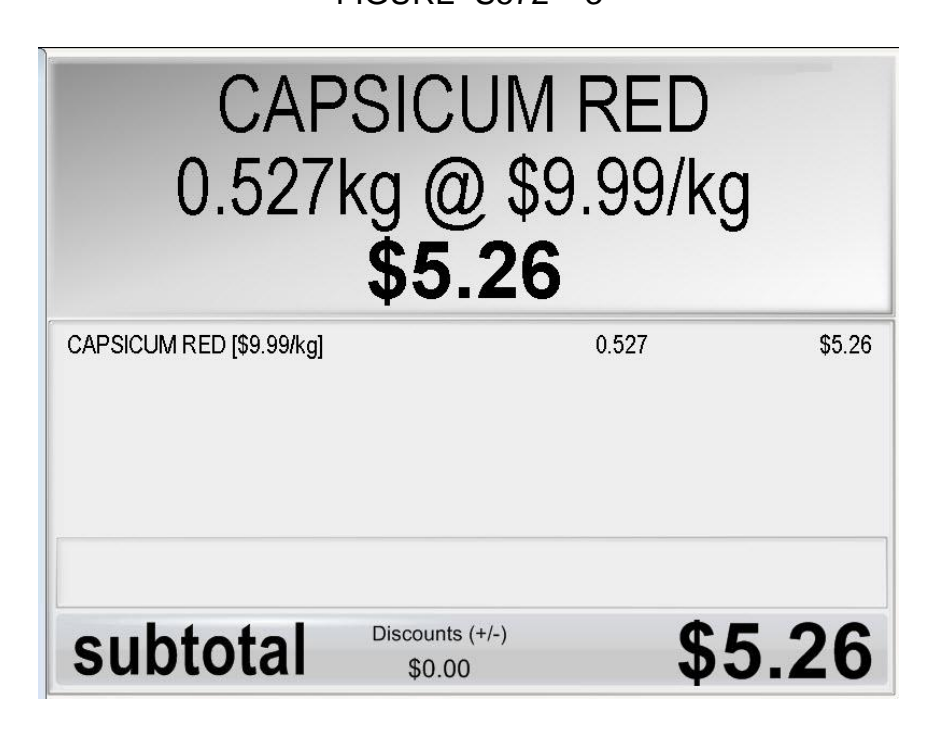
Typical Customer Screen