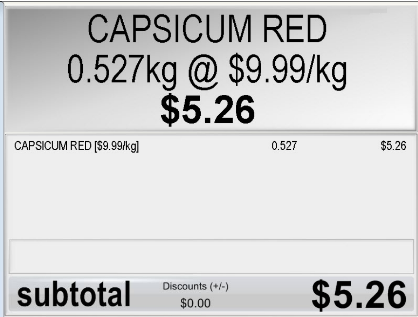
Typical Customer Screen